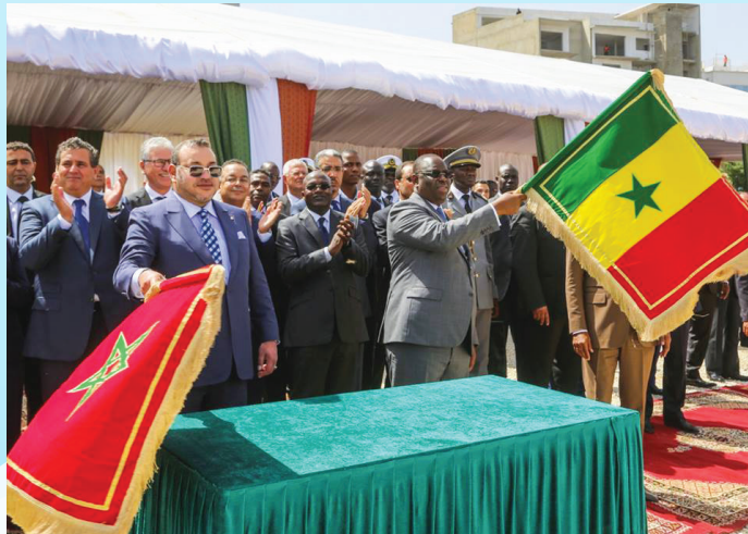
Sa Majesté le Roi Mohamed VI en compagnie de son Excellence, le Président de la République M. Macky Sall et du Ministre de la Pêche et de l'Economie Maritime, M. Oumar Gueye.

In Senegal, the sector of Fishing and Maritime Economy plays a leading socio-economic role.